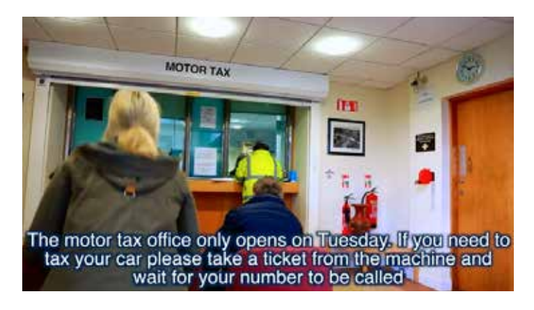
Motor tax waiting area

Baltinglass Municipal District holds monthly council meetings on the last Monday of the month at 10.30am except August. These meetings are open to the public to attend. Please note, the public are not allowed to approach elected members while seated during the meeting.